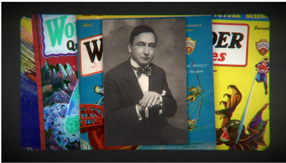
Tune Into the Future by Eric Schockmel

Tune Into the Future by Eric Schockmel (Samsa Film) has been selected at various festivals including Imagine Science Festival, Utopiales, Sydney Science Fiction Film Festival, 13th Annual Imagine Science Film Festival, and many others.