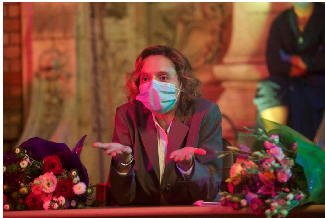
Bad Luck Banging or Loony Porn by Radu Jude

Collective by Alexander Nanau (Samsa Film): Short-listed at the Academy Awards (Best picture - Documentary and Best international feature film-representing Romania). The film has received over 40 awards and nominations and over 60 festival selections.